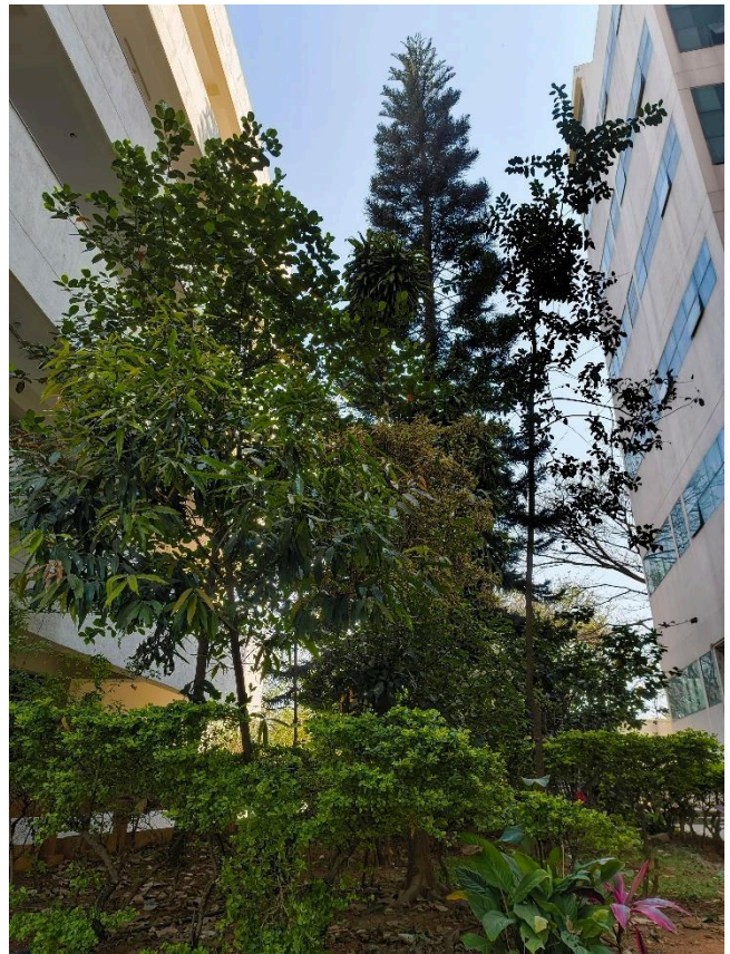
GAGANA P – I’A’ “Knowledge nurture as tree grows”