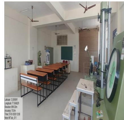
MATERIAL TESTING LAB