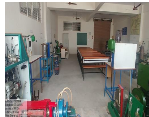
ENERGY CONVERSION LAB