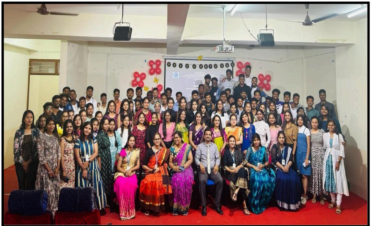
GROUP PICTURE WITH NEW BATCH: 2023-2025